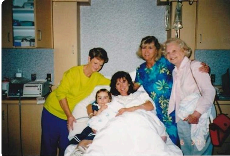
June 3, 2001